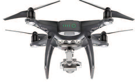
Fig. 2. DJI Phantom 4 PRO

In summary, in the final problem formulation, the equations 5, 6, 7 and 8 impose that each drone traverses a path starting and ending in the home depot, including a subset of the target points, without traversing the same target more than once.